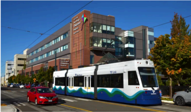
Mary Bridge Children's Hospital in Tacoma, Wash., October 6, 2023.